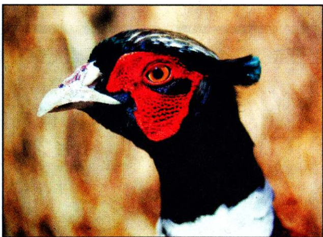
Pheasant, by Rolf Bouman