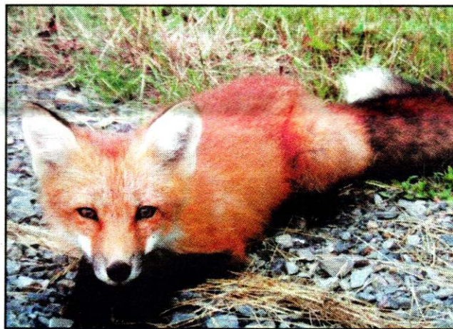
Red fox, by Rolf Bouman